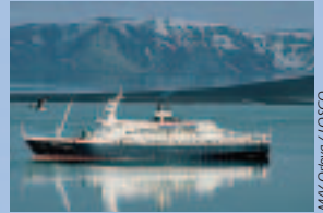
M/V Orlova / LOSCO